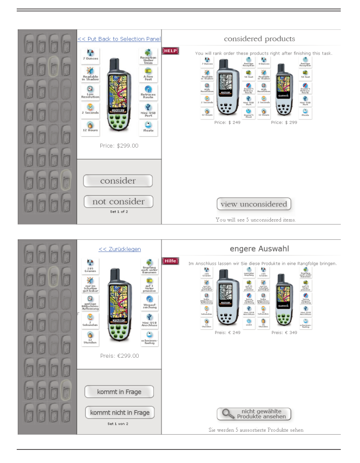
Figure 2 CONSIDERATION TASK IN ONE OF THE FORMATS (ENGLISH AND GERMAN)

Before respondents made consideration decisions, they reviewed screens that described GPSs in general and each of the GPS features. They also viewed instruction screens for the consideration task and instructions that encouraged incentive compatibility. Following the consideration task, respondents ranked profiles within the consideration set (these data are not used in this article) and then completed tasks designed to cleanse their memory. These tasks included short brainteaser questions that directed respondents' attention away from GPSs. Following the memorycleansing tasks, respondents completed the consideration task a second time but for a different orthogonal set of GPSs. These second consideration decisions are validation data and are not used in the estimation of any rules.