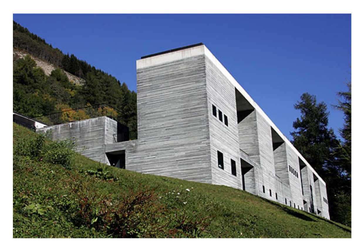
Exhibit 6 Therme Vals (Thermal Baths)