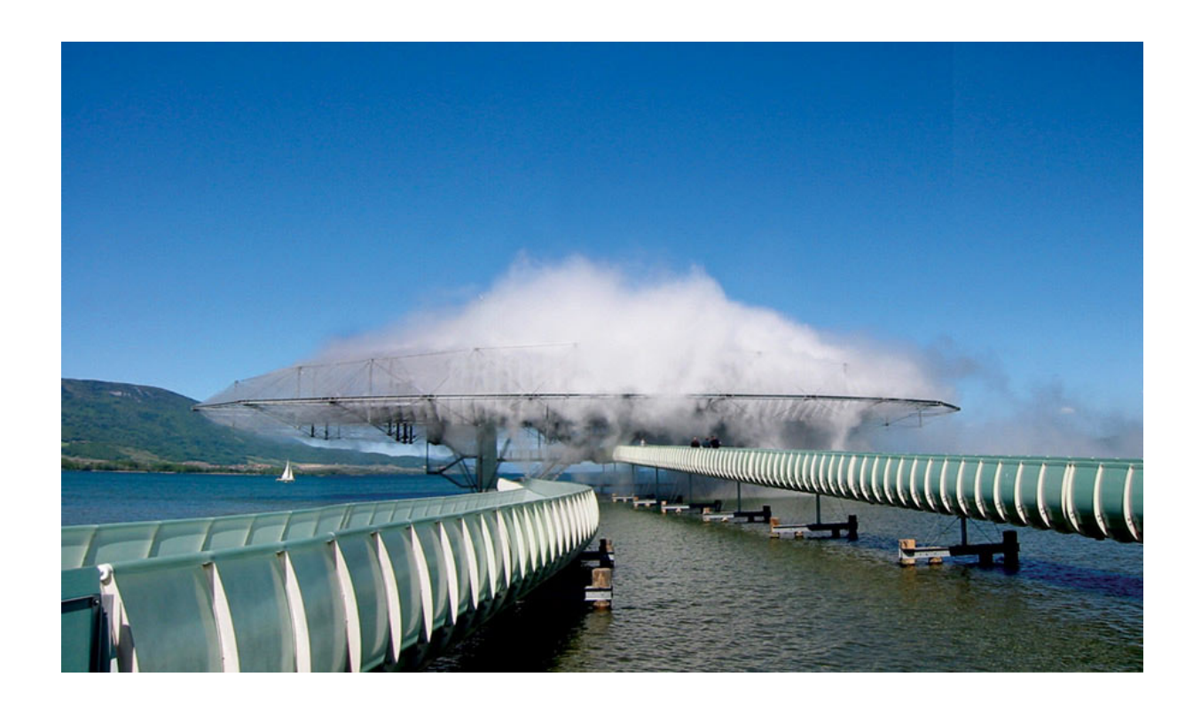
Exhibit 4 Blur Building, Swiss Expo