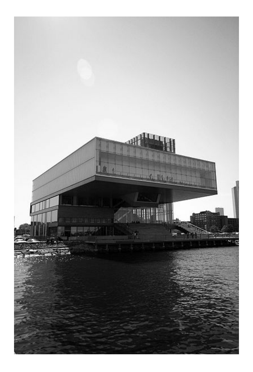
Exhibit 7 The New ICA