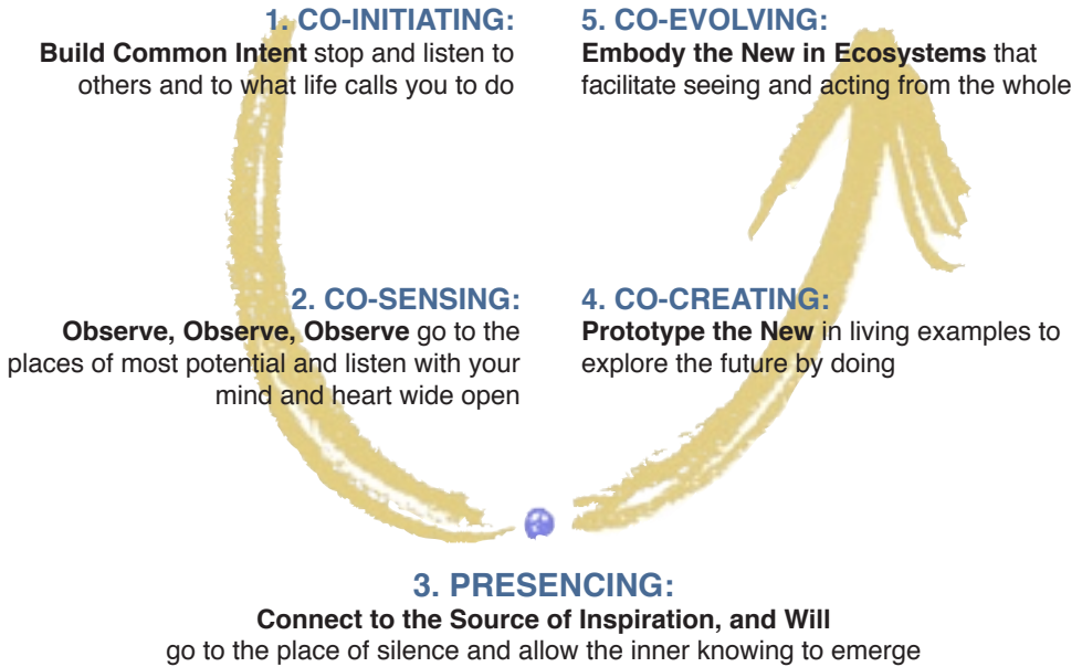
Figure 3. The U as One Process with Five Movements: In order to move from Field 1 or 2 to Field 3 or 4 ways of operating, we need to move first into intimate connection with the world and to a place of inner knowing that emerges from within, followed by bringing forth the new, which entails discovering the future by doing.