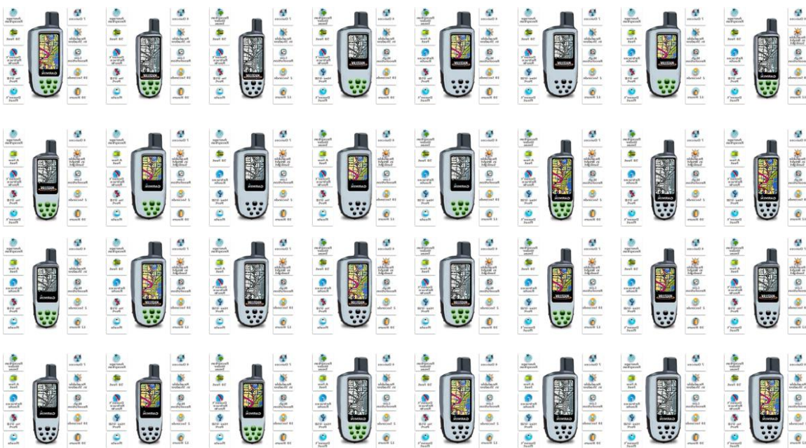
Figure 3 Choosing Among 32 GPS Profiles That Vary on 16 Features

We elaborate various heuristic rules in a later section, but one aspect shared by all of these rules is cognitive simplicity. Cognitive simplicity is based on experimental evidence in a variety of contexts (as early as 1976 by Payne; reviews by Payne, Bettman and Johnson 1988, 1993). Related evidence suggests that cognitively simple “fast and frugal” decision rules are prescriptively good ways to make decisions (Brandstatter et al. 2006; Dawkins 1998; Einhorn and Hogarth 1981; Gigerenzer and Goldstein 1996; Gigerenzer, Hoffrage and Kleinbolting 1991; Gigerenzer and Todd 1999; Hogarth and Karelaia 2005; Hutchinson and Gigerenzer 2005; Martignon and Hoffrage 2002; Simon 1955; Shugan 1980). Basically, with a reasonable consideration set (say 5-6 automobiles), the best choice from the consideration set is close in utility to the best choice from 350 automobiles, but the savings in evaluation costs are huge (Internet search, dealer visits, test drives, reading Consumer Reports , talking to friends, etc.). Furthermore, cognitively simple decision rules are often robust with respect to errors in evaluation.