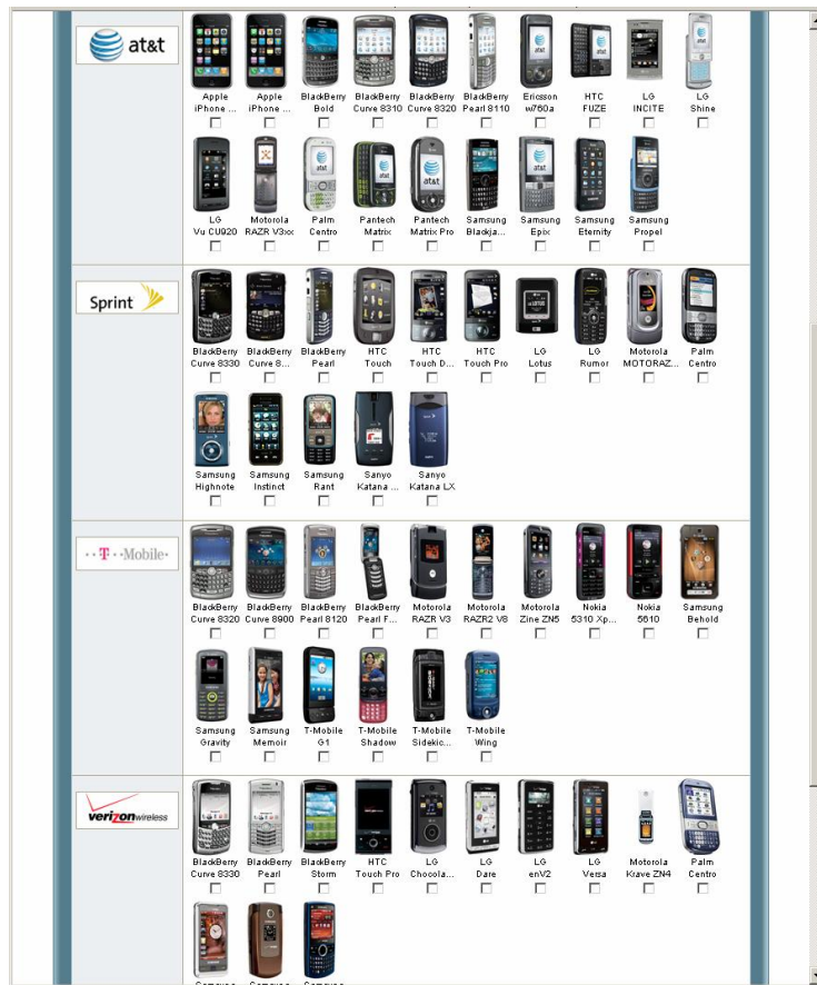
Figure 4 Illustrative Web Page for Mobile Telephones

Not all decisions encourage heuristics. The following decision characteristics make heuristics less likely: