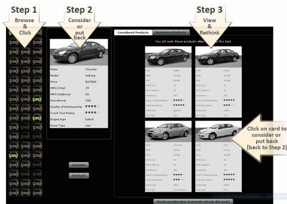
Figure 1 “Bullpen” Measures of Consideration

Such formats beg the question: does it help to measure and model consideration decisions? For example, if the focus is on ultimate choice, why not simply model the decision to choose a profile from the set of all profiles, rather than model the decision in two steps? As illustrated in Figure 2, we can write equivalently that \text{Prob}(\text{choose } a) = \text{Prob}(\text{choose } a \text{ from consideration set } C) * \text{Prob}(\text{consider set } C) . The motivation for modeling consideration lies in research that indicates that consumers often use different (heuristic) decision rules for consideration than for choice. (In addition, as argued above, managers can affect consideration directly.)