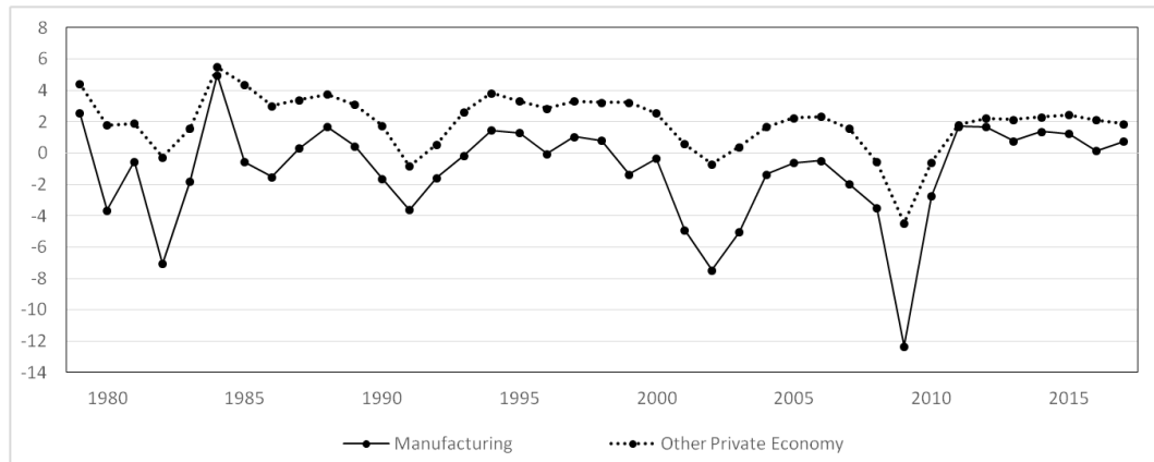
Chart 1: Employment Growth Rates in U.S. Manufacturing and Other Private Economy Industries, 1980-2016 (per cent change)