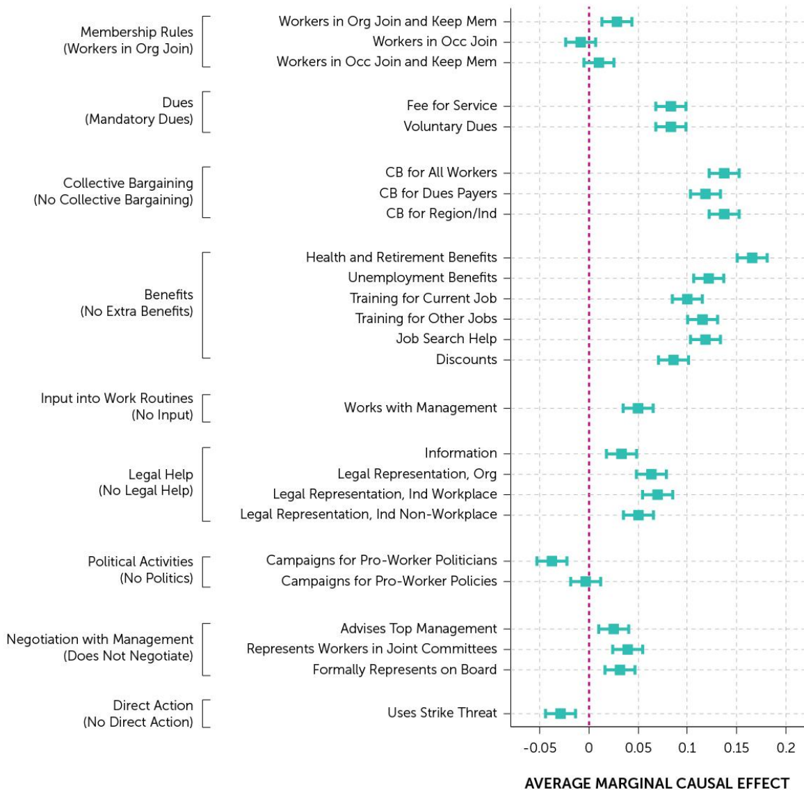
Figure 4: Which Labor Organization Would You Join? (0/1)

Further analysis of these data indicates that the highest interest is in joining and paying dues in organizations that provide a combination of collective bargaining, individual labor market services, and roles in organizational decision-making. Opposition to strikes and political activity declines in importance in organizations that combine these modes of representation and among workers currently represented by unions. These results suggest that the American workforce does not want to choose between existing unions that focus on collective bargaining and the various emerging forms of worker advocacy that focus on providing services. Significant numbers also value informal participation processes offered by employers. Thus, today’s workforce wants to go beyond existing labor law to have available a wider array of options for gaining a voice at work and more robust roles in advising and sharing decision-making with their employers. 8 Some workers, however, are reluctant to exercise the traditional sources of power (political action and strikes) that unions have relied on in the past.