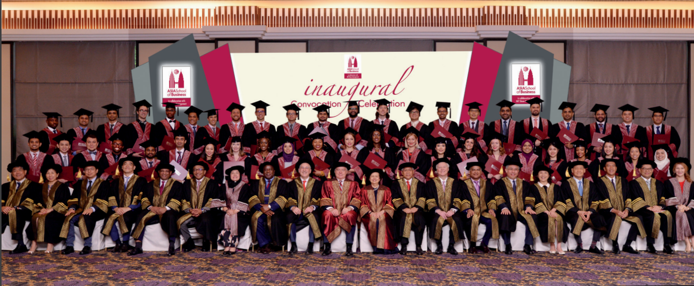
Inaugural graduation: the first graduates of ASB MBA professionals with ASB and MIT deans and the ASB Board of Governors.