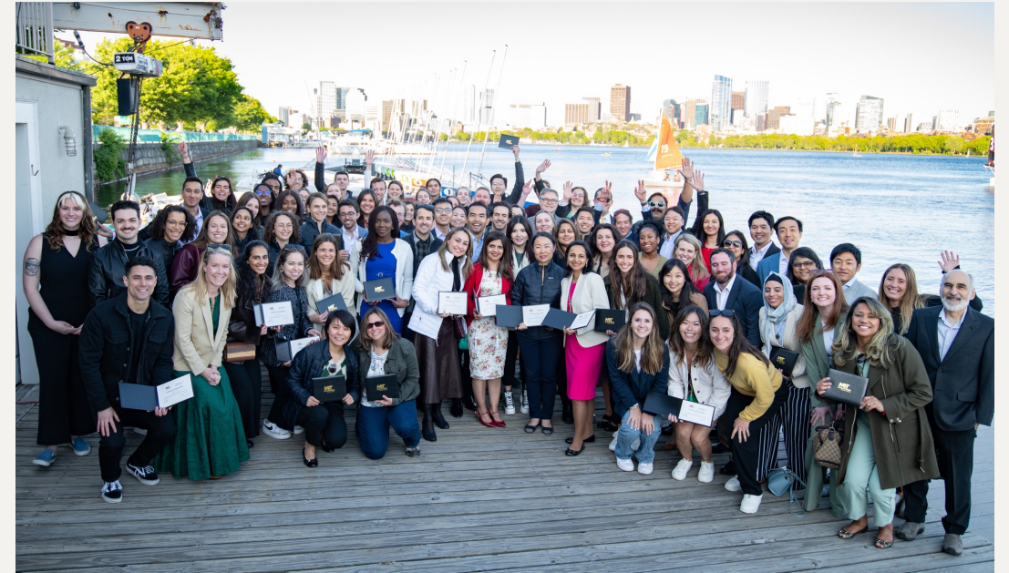
Sustainability Certificate Class of 2023